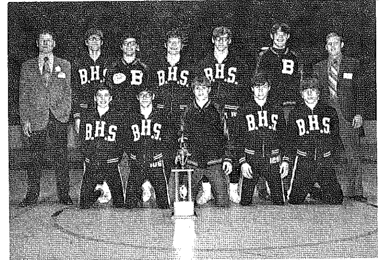
1972 State Class "A" Wrestling Champions -- Bismarck