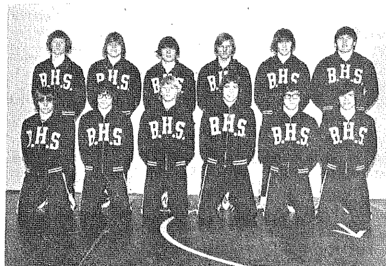
1974 Class A State Wrestling Champions — Bismarck

Total Disbursements . . . . . $ 7,556.75