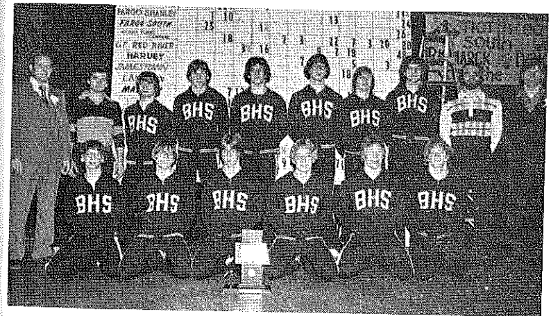
1979 State Class A Wrestling Champions — Bismarck