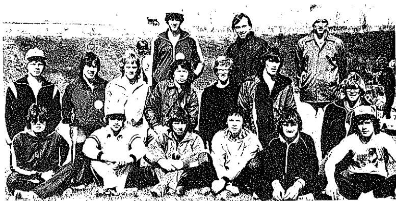
1979 State Class B Boys' Track and Field Champions — Napoleon