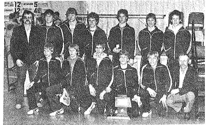
1984 State Class B Wrestling Champions — Velva