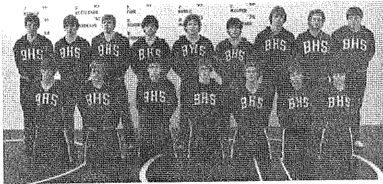
1984 State Class A Wrestling Champions — Bismarck.