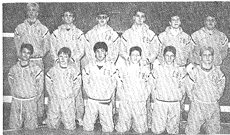
1987 State Class A Wrestling Champions - Bismarck Century